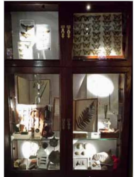
The cabinet displays only a small part of the much larger museum collection of specimens

From there we all split up to look at the various collectons on the ground and first floors. Later Nicky was able in small groups to show us the sad & sorry state of the botanical and other specimens housed in the attic. This store room has several old cabinets and stacked files containing important herbariums and other valuable natural history specimens going back many years. 1