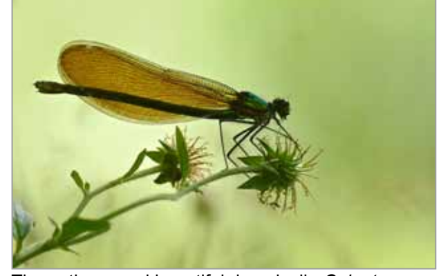
The aptly-named beautiful demoiselle Calopteryx virgo .

Suddenly having all these new species is amazing. Bedfordshire had 21 resident species of odonata and could very soon have several more. The only trouble is that the newcomers can be a bit tricky to identify and differentiate from the usual species that we have, so it's back to the field guide for help.