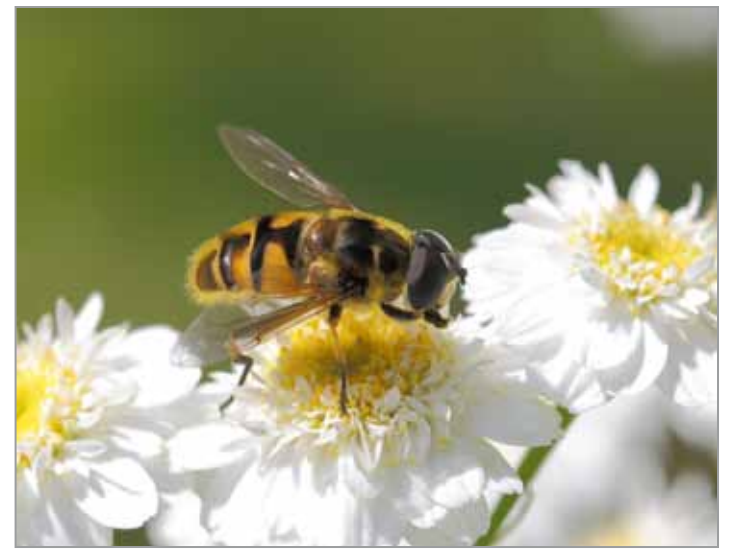
Myathropa florea.

High summer is a great time for watching hoverflies, and among them is the common and striking Myathropa florea . Living mainly in woodlands, the species is strongly territorial, and males will defend a patch of space by sitting on an exposed leaf or twig and zooming out to challenge rivals or encounter females. They will even come and hover near a human passer-by, buzzing loudly. They are of course quite harmless; they just like to know what's going on! Another good place to look for them is on the tops of umbellifers, particularly Hogweed and Angelica, where they feed on nectar and pollen.