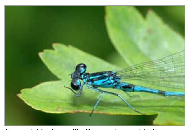
The variable damselfly Coenagrium pulchellum.