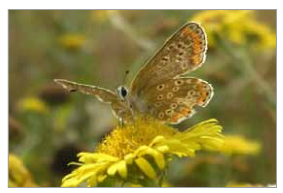
Common Blue Polyommatus icarus.