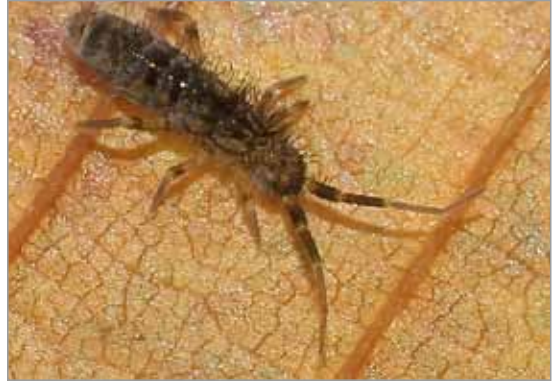
Orchesilla villosa, Maulden Wood