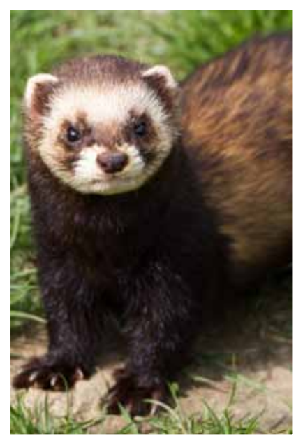
Polecat Mustela putorius.

The Vincent Wildlife Trust has launched its next national polecat survey, to run from 2014 to 2015, and needs your help to gather up to date information on the current distribution of the polecat in Britain.