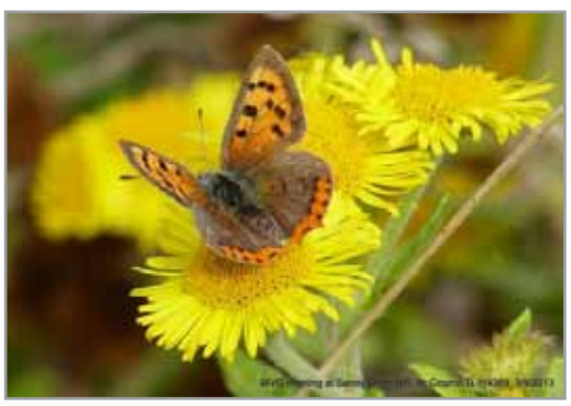
Small Copper Lycaena phlaeas.

A donation from sales will be made to Butterfly Conservation (www.butterfly-conservation.org/).