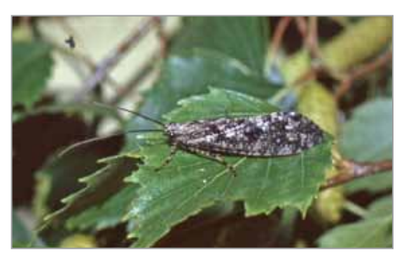
Agrypnia varia, Stockgrove Park