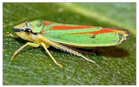
Graphocephala fennahi [Cicadellidae], Sandy Lodge