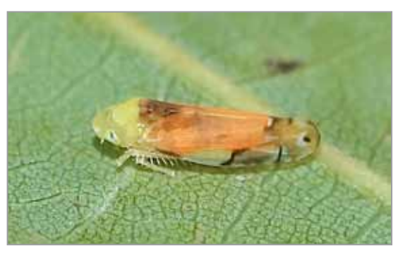
Eurhadina pulchella [Cicadellidae], Flitwick Moor