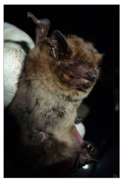
The elusive Nathusius' Pipistrelle Pipistrellus nathusii.

We traditionally stop surveys at the end of September, but this year we ventured out on 6<sup>th</sup> October to look for autumn swarming at Luton Hoo. Autumn swarming happens just before hibernation and consists of bats coming to a specific point (often near a hibernation site) to look for a mate. This year we tried two different areas of the estate and had a very successful evening. As well as Daubenton's, Natterer's, Brown Long-eared, we also caught a Barbastelle. This is the first time we have ever caught a Barbastelle south of Luton, and caused much excitement. It was a great way to celebrate coming to the end of the main bat season.