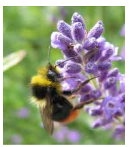
Red-tailed Bumblebee Bombus lapidarius . Photo courtesy Wikimedia Commons

Tree Bumblebee Bombus hypnorum (More recently colonising Britain from the continent)