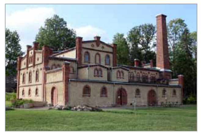
The old vodka factory.

warblers, northern wheatears and marsh and montagu's harriers.