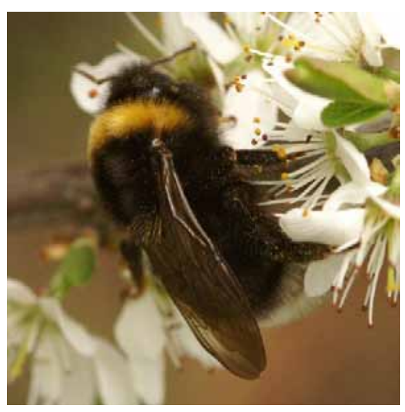
Gypsy Cuckoo-bee Bombus bohemicus . Photo courtesy Wikimedia Commons

significantly increased the amount of bumblebee habitat and foraging areas, especially on the provision of field margins, where legumes and other wildflowers have been sown. The ELS, HLS and Organic ELS have had a significant effect on the increase in bumblebee habitat mainly on field margins, and especially on organic farms where the introduction of crop rotation and the use of Legumes has again had a beneficial effect. More effective management of hedgerows and control of pesticides has also made a significant contribution to increasing bumblebee foraging habitat.