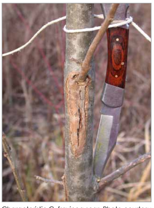
Characteristic C. fraxinea scar.