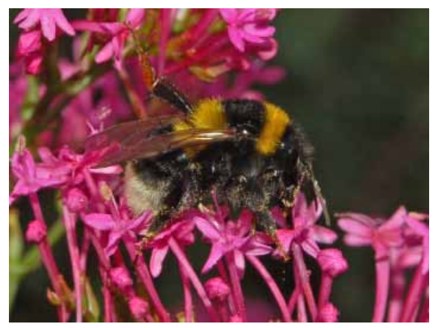
Garden Bumblebee Bombus ruderatus.

It is believed that this insecticide is contributing to Colony Collapse Disorder in honey bees, and reducing bees immune systems, and their ability to navigate properly. It has been shown that bees subjected to low level exposure over a long period of time is likely to be as damaging as high exposure over a short period of time, and the bees show a much higher susceptibility to disease especially Nosema.