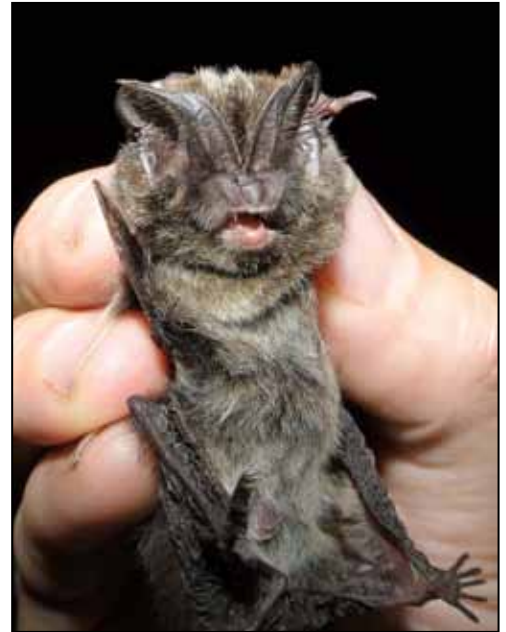
A Barbastelle in the hand is better than...?

While the nets were being set up I wandered down the lane and got the most wonderful sighting of a badger, who being downwind took precisely no notice of me and trudged on his way sedately before skittishly skipping along into the wood.