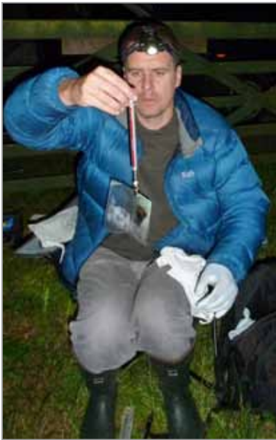
Weighing a bat is a delicate job.

It was at this point that we discovered a snag about Swineshead Wood and its environs: all the roads ran in valleys and so it was very hard to get a signal and there is a ridge of higher ground with practically no high vantage points. As it turned out she did not seem to travel far and covered much the same ground every night. The area she apparently covered was much smaller than that travelled by other bats we had tagged, possibly suggesting she was a young bat (born last year) still finding her way around. Older bats usually have larger foraging areas which they patrol on a regular basis.