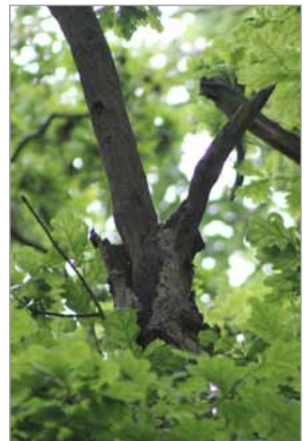
Barbastelle roost.

The tag lasted a very impressive, not to say exhausting, fourteen days and over 20 people came out to help us watching emergence and/or radiotracking. By the end of the fortnight we were exhausted.