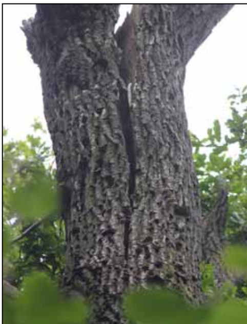
Barbastelle roost.

Barely had I caught my breath than I heard barbastelles – several of them – and no sooner had I reported this on the radio, than there was a call “Barbastelle in the net!”. Any-one who has ever come out with us knows that most nights all we catch is our death of cold, but tonight the woodland was feeling sorry for us. In the course of ten minutes we caught four barbastelles, each of which was removed almost as soon as it hit the net. Normally we check nets every ten minutes, but this time we could sit in our seats eating cake and hear bats flying into the net with our bat detectors.