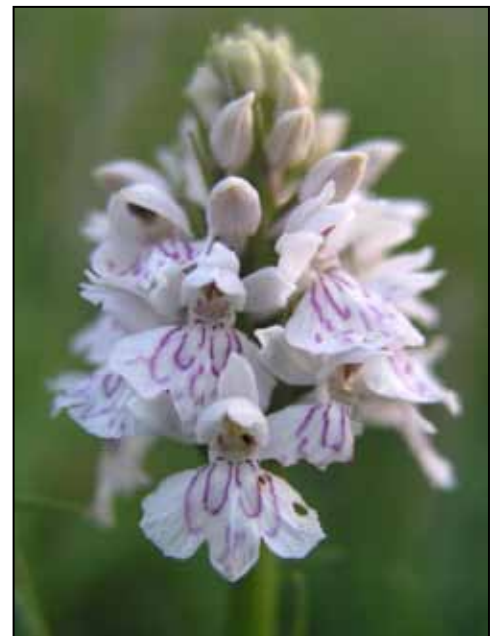
Common spotted orchid Dactylorhiza fuchsii .

Have a look on the grass around road verges, out of town shops and along country footpaths and riverbanks...you never know what may be found.